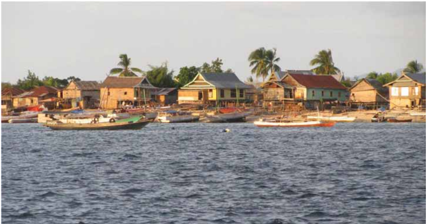
The Sustainable Ocean Solutions project will develop solutions for the world's dwindling fisheries. Because of overfishing, cities and villages throughout Indonesia now must import fish.