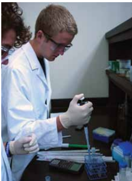
UC Santa Barbara plans to share the result of the students' research with the worldwide C. elegans research community by publishing their data on the Internet.