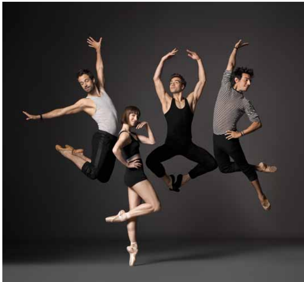
The New York City Ballet Moves made its West Coast debut at the Granada Theater.