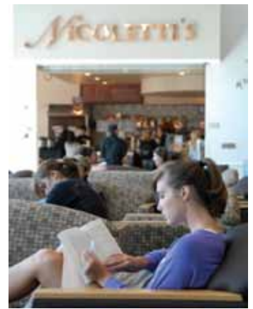
Studying at the University Center