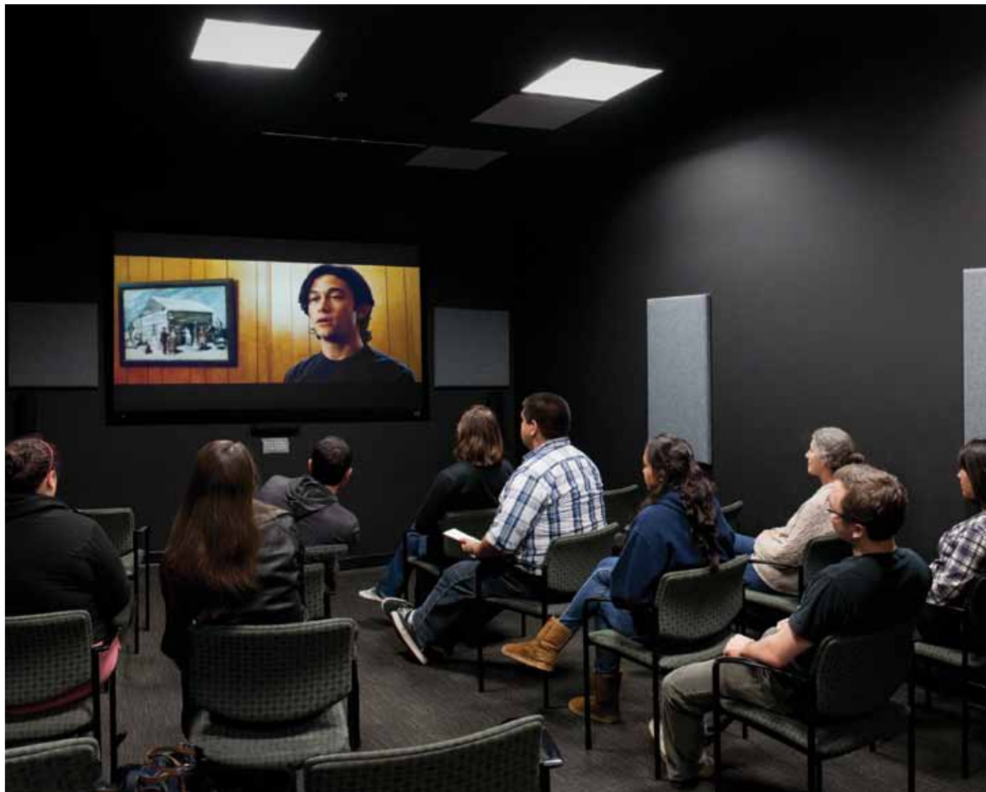
Film studies students watch "The Lookout," written and directed by alumnus Scott Frank, in a screening room named in his honor at the Carsey-Wolf Center. His recent gift will support the expansion of the screenwriting program.

cultivates critical and analytical skills through the study of media objects and practices. The department's teaching, production, and screening facilities have been expanded at the Carsey-Wolf Center, making it one of the leading international film and media centers for graduate and undergraduate study and research. Students also explore future career paths with a network of committed alumni, including Frank.