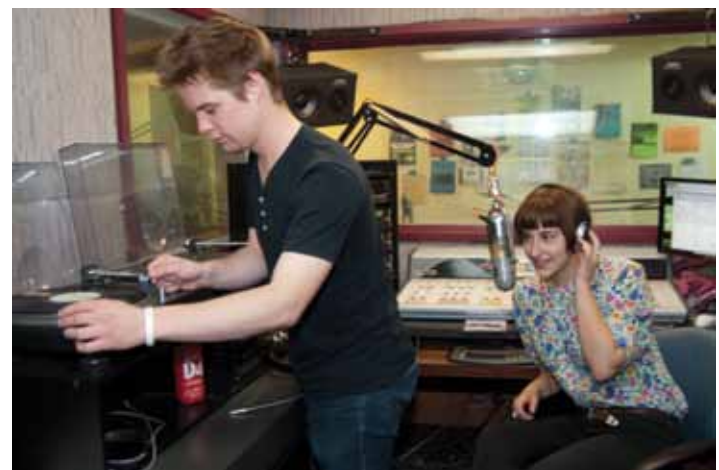
A KCSB-FM disc jockey