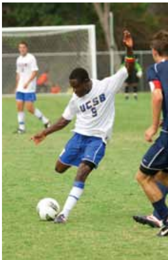
Men's soccer match

Mentor Graphics The David and Lucile Packard Foundation SAIC/Telcordia Technologies