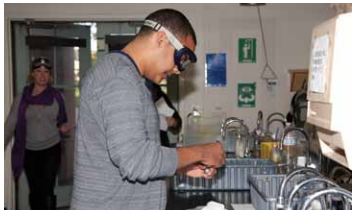
Conducting an experiment in a chemistry laboratory