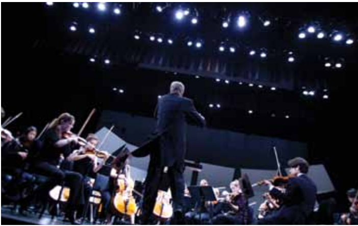
The UCSB Symphony performs.