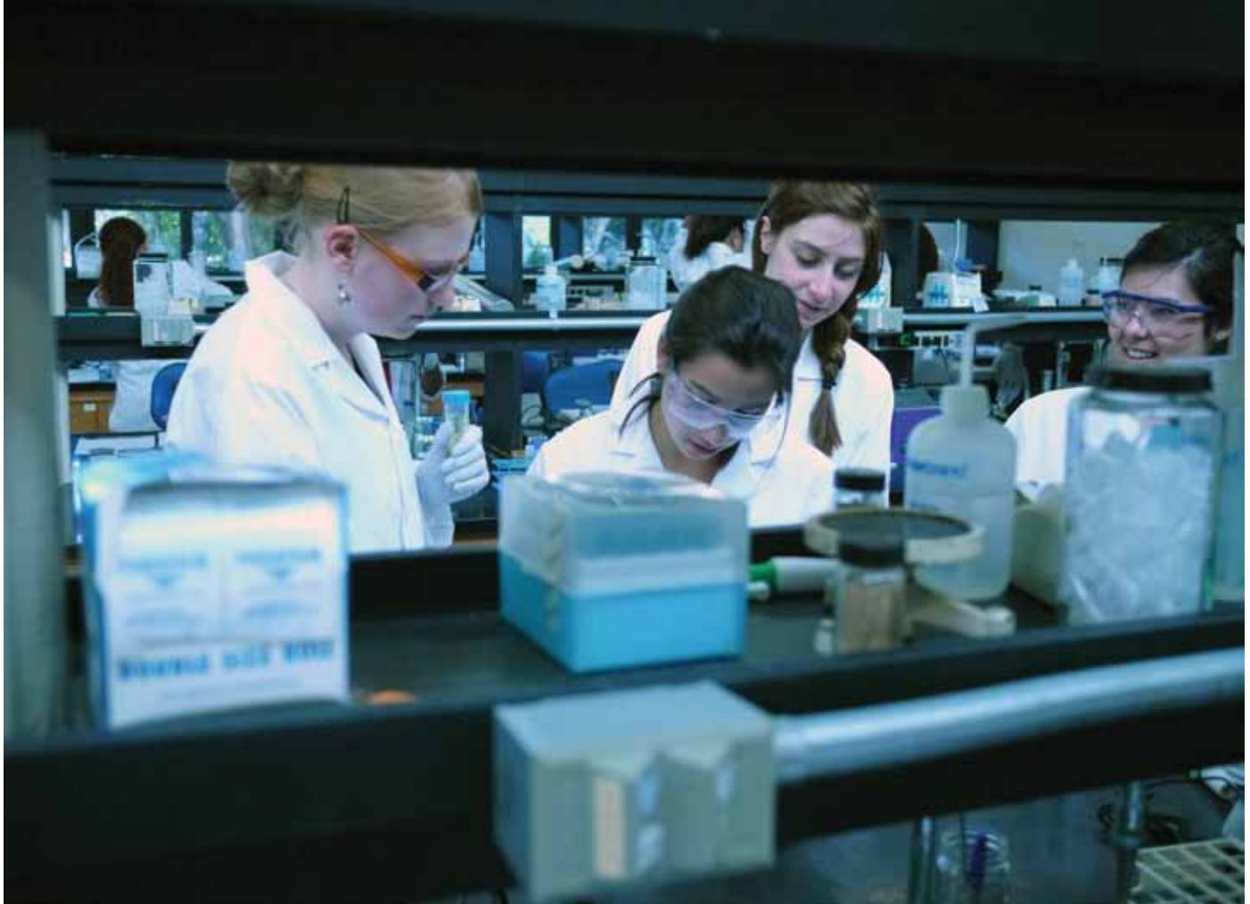
Hundreds of students enrolled in introductory biology are conducting original research focused on the roundworm Caenorhabditis elegans , a widely used genetic model for biomedical research.