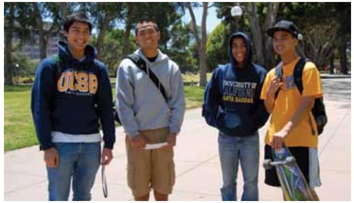
Friends gather between classes.