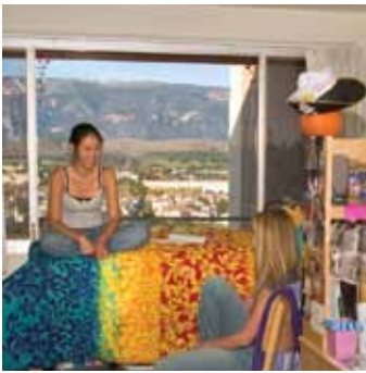
Socializing in a dorm