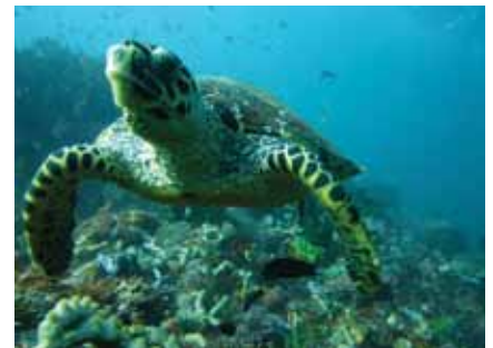
A curious sea turtle in Indonesia

In addition, the Walton Foundation has contributed $1 million in support of fellowships for highly qualified Bren School graduate students enrolled in the master of environmental science and management degree, with