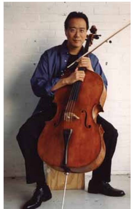
Arts & Lectures brings world-renowned artists and musicians to campus to teach and perform, including cellist Yo-Yo Ma.