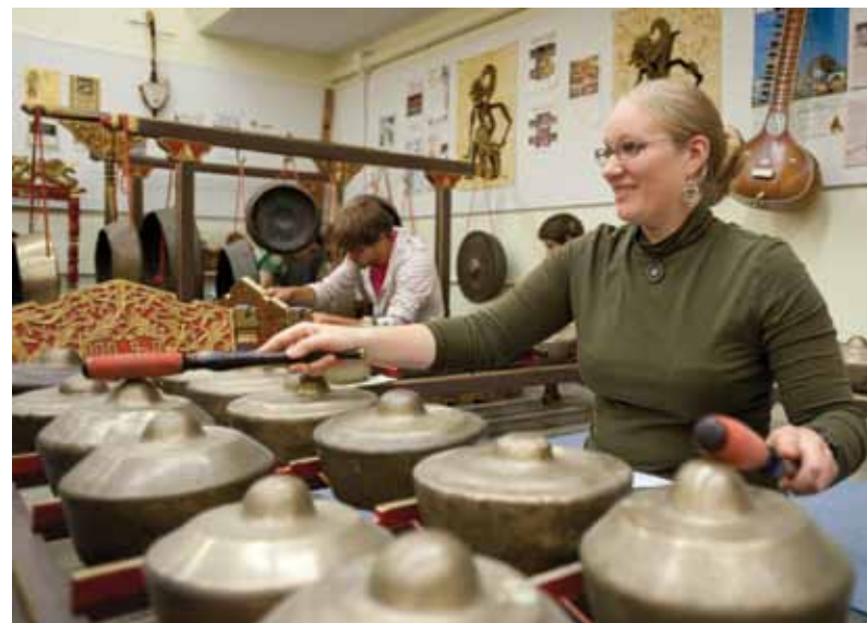
Undergraduate and graduate students across the academic disciplines will benefit from the increasing gifts for student support.