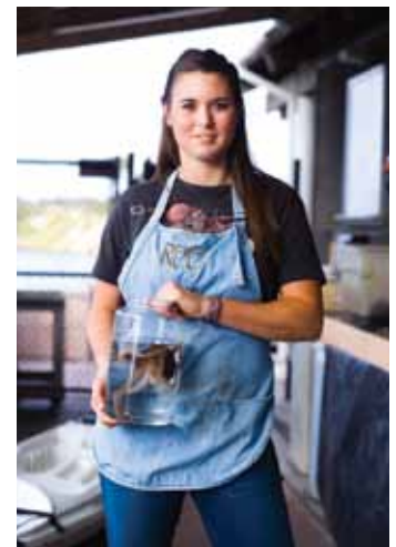
Working at the aquarium