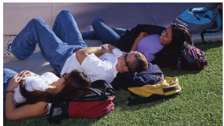
Enjoying the beauty of UCSB.