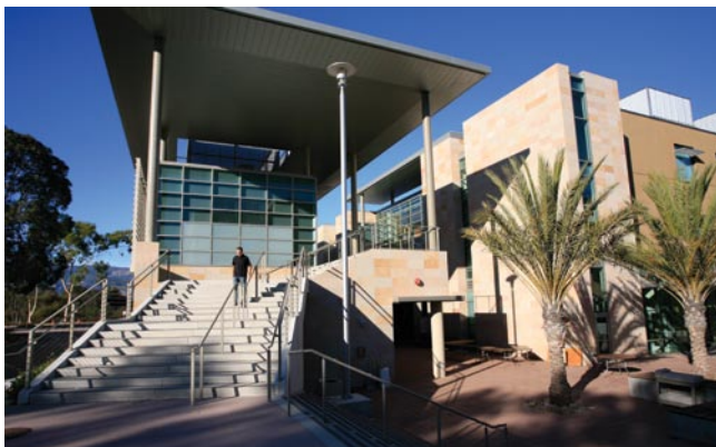
The state-of-the-art Engineering Science Building.