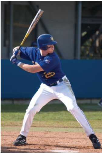
Playing baseball at UCSB.