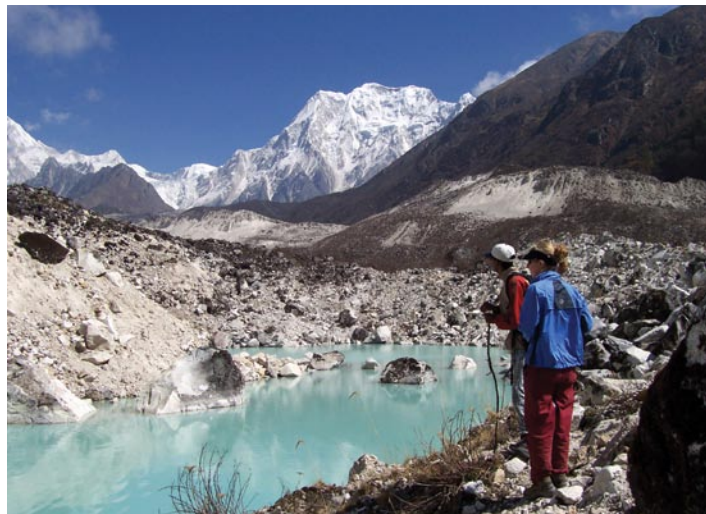
Conducting crustal studies in the Himalayas.