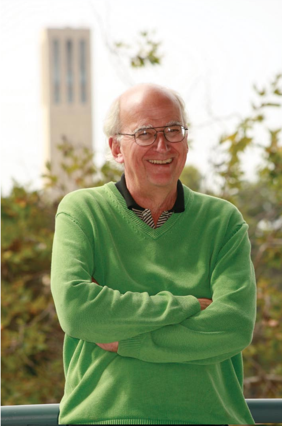
Michael Gazzaniga, the new director of UCSB's SAGE Center for the Study of the Mind, has had a distinguished teaching and mentoring career that has included beginning and developing centers for cognitive neuroscience at UC Davis and at Dartmouth, and founding the Journal of Cognitive Neuroscience, of which he is the editor-in-chief.

SAGE Publications has contributed $3.5-million to launch a dynamic new interdisciplinary research center for the study of the mind at UC Santa Barbara. SAGE made the gift to commemorate its 40th anniversary as a leading international publisher for scholarly, educational, and professional markets.