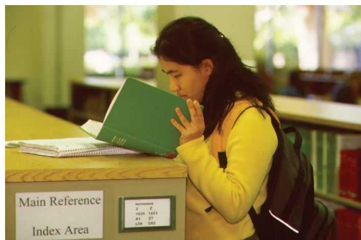
Studying in Davidson Library.