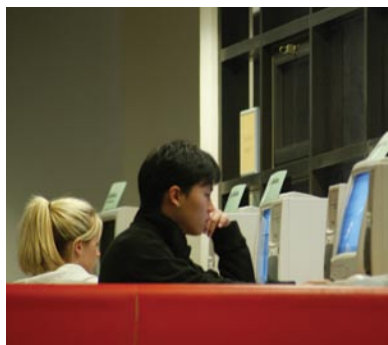
Students writing in a computer lab.

Enhanced opportunities for our most talented and deserving students, including more private support for fellowships and scholarships. In 2005-06 alone, a record $4.9-million in student support was raised.