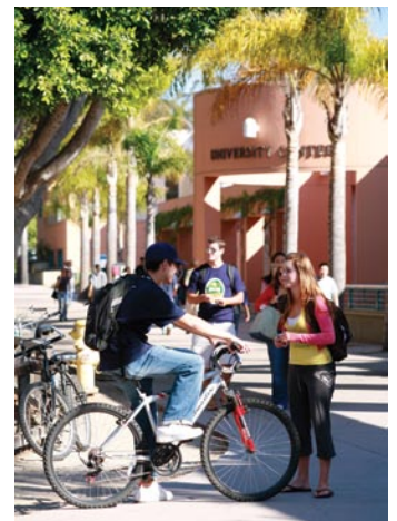
Socializing outside the UCen.

Epitronics Corporation Equistar Exxon Chemical Co-Paramis Exxon Research and Engineering Company ExxonMobil Foundation Federation Of Basque Navarrese Savings & Loan Fisher-Rosemount Systems, Inc. Ford Motor Company Fund Franciscan Friars Friends of the UCSB Library Fuji Electric Co. Ltd Fujitsu Laboratories of America, Inc. Fujitsu Limited Furukawa Electric Company Ltd GE Foundation GE Global Research The J. Paul Getty Trust GlaxoSmithKline Godric Foundation Goethe Institute Los Angeles Calouste Gulbenkian Foundation Evelyn and Walter Haas Jr. Fund Haddad Family The Haynes Foundation The William Randolph Hearst Foundations William and Flora Hewlett Foundation Hewlett-Packard Hewlett-Packard Company Hewlett-Packard Laboratories Hewlett-Packard Logic Systems Hoechst Celanese Corporation Hoffman-La Roche, Inc. Honeywell Inc. Hughes Aircraft Company Hughes Electronics IBM Corporation IBM Matching Grants Program ICI Group Technology Institute for the Study Of American Religion Institute for Advanced Study Instituto Camoes Intel Corporation International Foundation for Telemetering International Shinto Foundation Intrawest Mammoth Corporation The Jacobs Family Foundation Japan Bamboo Association Japan Business Association of Southern California The Japan Foundation Japan-U.S. Friendship Commission JDS Uniphase Corporation