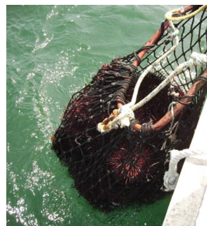
UCSB scientists are working as stewards of the oceans to help develop sustainable fisheries management practices. Pictured above are a fishing boat off the Channel Islands and a bag of sea urchins.

The goal of the project is to partner with fishing communities, regulators, and other stakeholders to develop and test management, marketing, and financing approaches that bridge the gap between current financial needs and future economic gains.