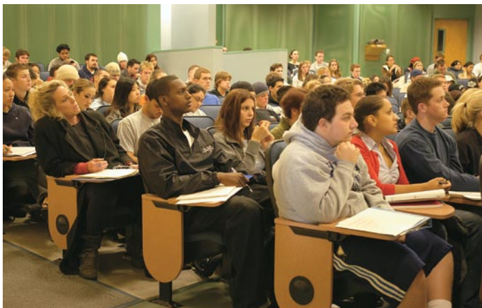
Attending class in Isla Vista.