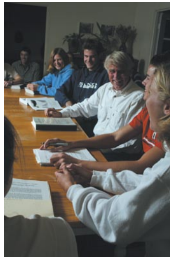
An undergraduate honors seminar.