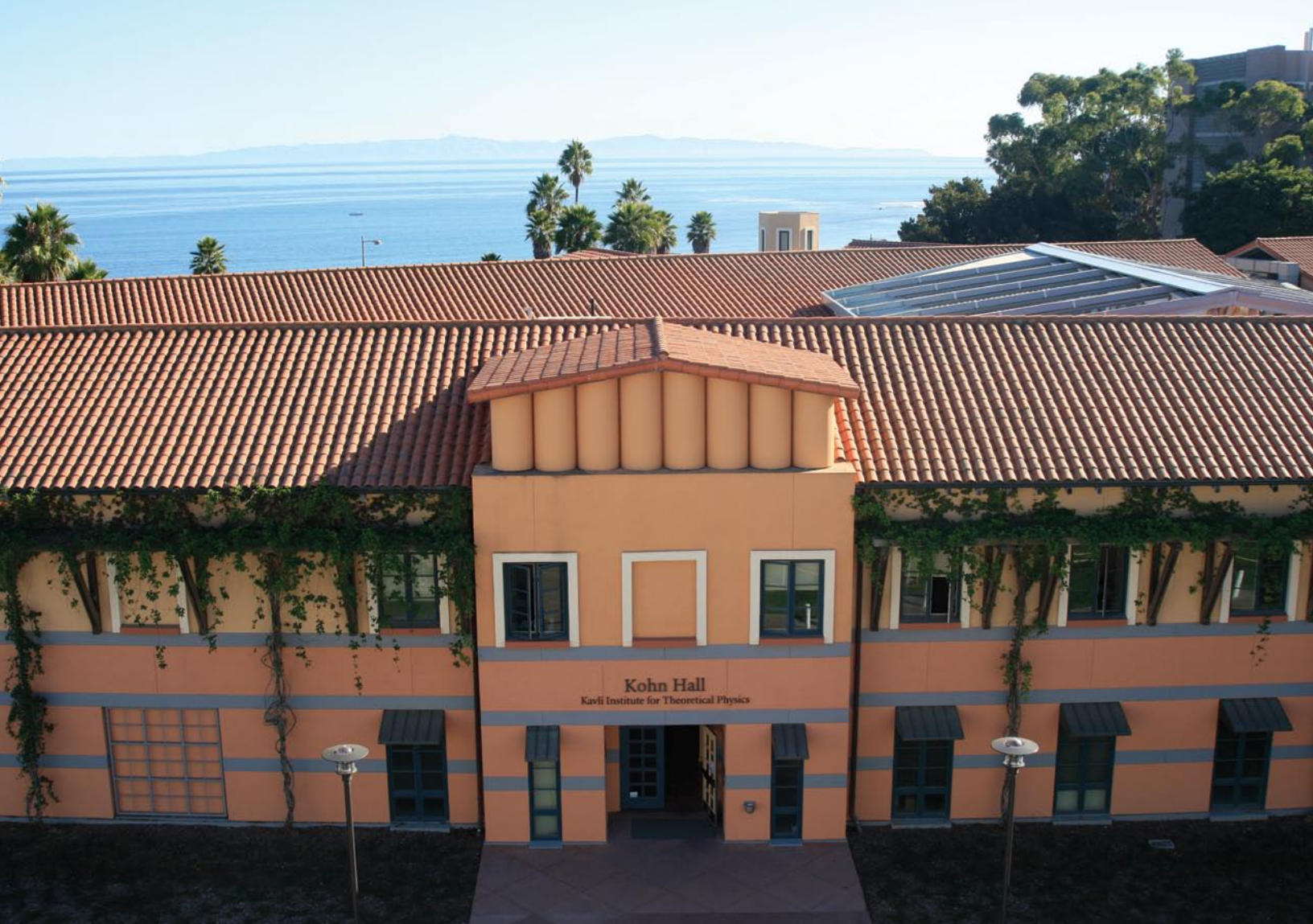
A view of Kohn Hall, home of the Kavli Institute for Theoretical Physics, with the Pacific Ocean and Santa Cruz Island in the distance.