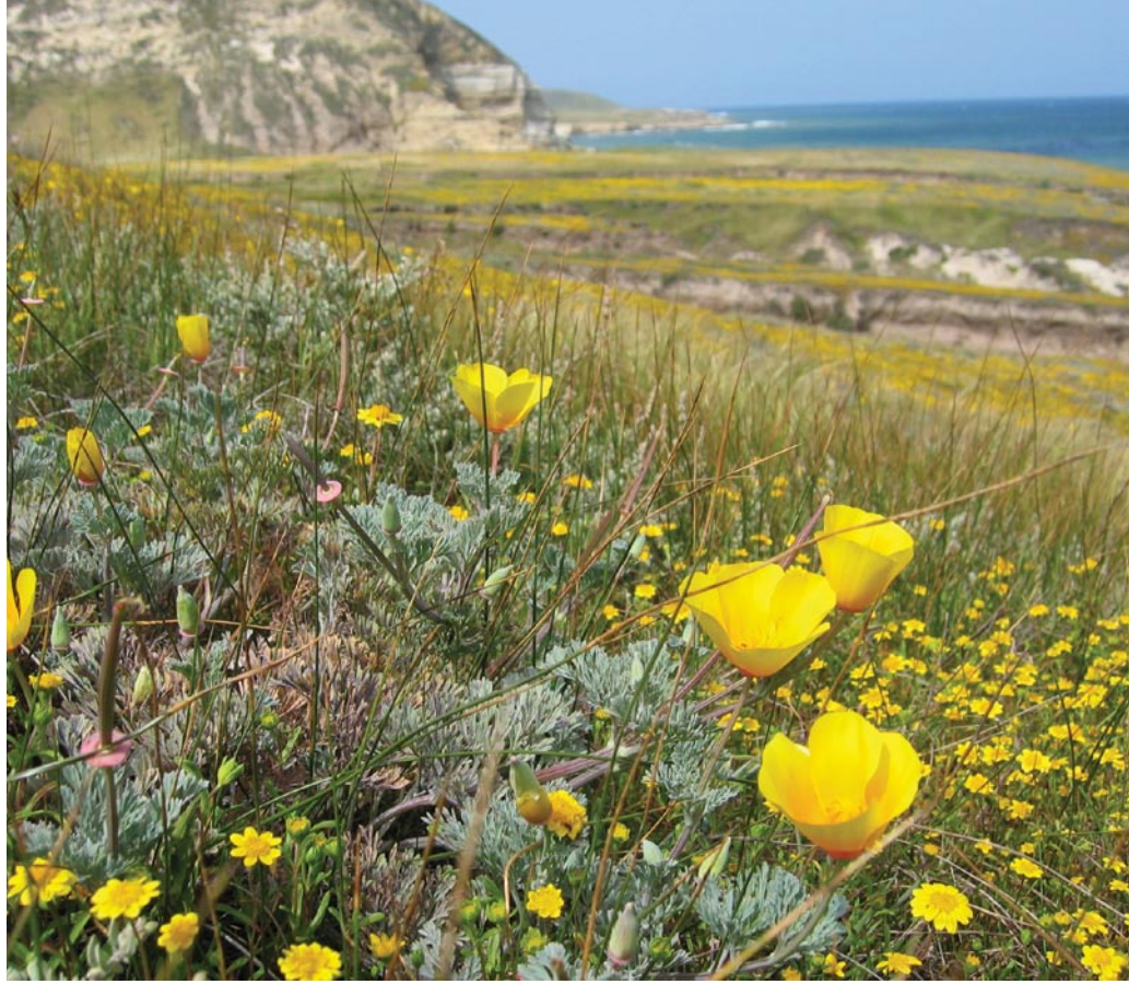
UCSB biologists conduct research and teach in a myriad of unique environments including the Pacific Ocean, deep coastal basins, marine coastal ecosystems, and mountain, chaparral, and oak woodland and grasslands, such as the Sedgwick Reserve. The Sedgwick Reserve is part of the University of California's Natural Reserve System.